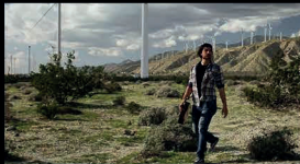
Large Image Field Large image field for full freedom in composition