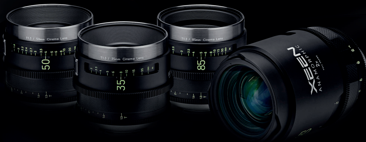
Meister 50mm T1.3