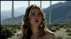
Beautiful Skin Tones Beautiful skin tones and precise color rendition