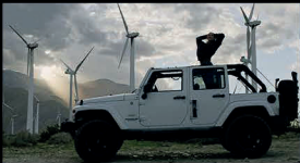
Low Distortion Low distortion for uncompromised anamorphic capture