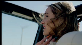
Fast T-stop Fast T-stop for shallow depth of field