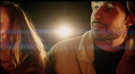
Cinematic Bokeh Cinematic bokeh with high contrast and nice focus fall-off